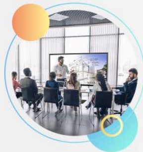
Taking Snapshot and Sharing the same via mail to all the Stake holder from the panel itself within no time