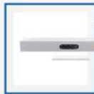
Room Kit Plus for VC