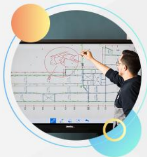
Annotation on the Live Content being displayed on Panel