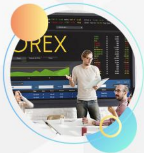
Live Share Market Monitoring