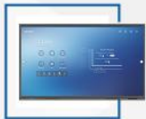
Newline Q series Display is used for Display and Annotation Interactive