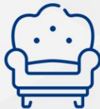
Clubs & lounge