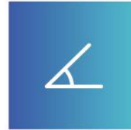
178 DEGREE VIEWING ANGLE