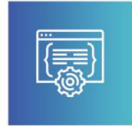
MEDIA SUITE OF ANNOTATION SOFTWARE