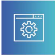
BUNDLED WITH EDUCATIONAL APPS